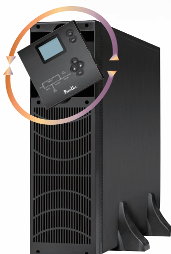
The LCD panel can be rotated