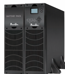
Battery Cabinets (Optional)